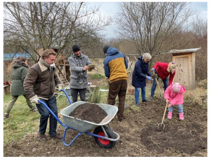
The two youngest children with their grandmother taking a break from the garden work. A student plays lively tunes to keep them happy.