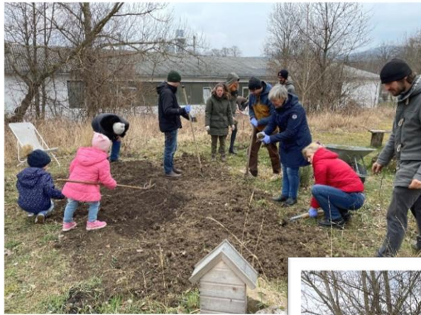
Everybody is enthusiastic about getting the garden work done.

The children have now started school and kindergarten and the family have been equipped with a bank account, support from the state for every member and we supply a daily midday meal until they are able to cook and provide for themselves. Just the other day the family took part in preparing our little garden to plant vegetables. Students from the Rudolph Steiner Seminar were involved in caring for the children. We have also been able to secure an apartment for a second family who two children of which one is in need of special care. This little boy in a wheel chair will be able to visit the Karl Schubert School in Vienna from Monday onwards. Although these people have been through unimaginable stress and fear they are all cheerful and extremely grateful, that all so far has gone well for them. With them we join and pray that they will soon be able to return in peace to join their loved fathers and brothers who stayed behind to protect their country. Many parents and friends have contributed donations to support this effort. We are very thankful.