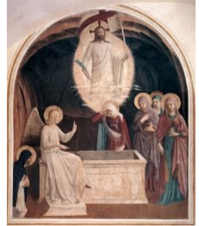
Fra Angelico – Women at the grave